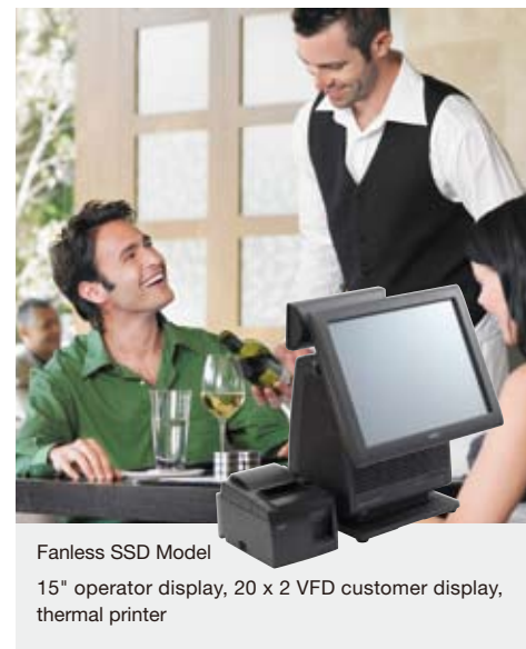
Fanless SSD Model 15" operator display, 20 x 2 VFD customer display, thermal printer