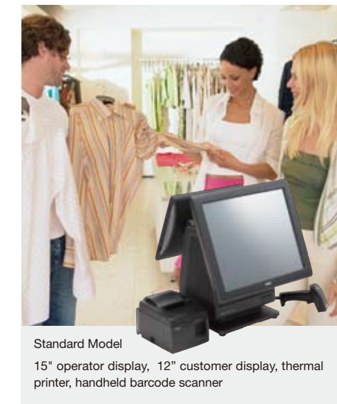
Standard Model 15" operator display, 12" customer display, thermal printer, handheld barcode scanner

Large store chains require the lowest TCO possible. The eco-friendly and tool-free design of TWINPOS G5 can significantly lower your electricity and service costs.