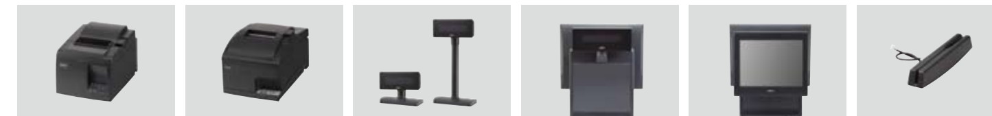
Thermal printer Dot impact printer External VFD 20 x 2 VFD 12" LCD MSR

*Features and specifications are subject to change without notice. *Peripheral availability may vary depending on area. For details, please visit your local dealer or http://www.nec.com/pos/ *Microsoft Windows and the Windows logo are trademarks or registered trademarks of Microsoft Corporation in the United States and other countries. *Celeron®, Atom™ and Core™ are trademarks or registered trademarks of Intel Corporation. See the notes in the relevant products for details. *PassMark® is a registered trademark of PassMark Software Pty Ltd. *The colors of products shown in this brochure may vary from actual product colors due to printing conditions. *When exporting this product, follow necessary procedures such as application for export permits from the Japanese government, as stipulated in the Foreign Exchange and Foreign Trade Control Law. Also, follow required procedures for applicable U.S. Export Administration Regulations or other foreign government regulations.