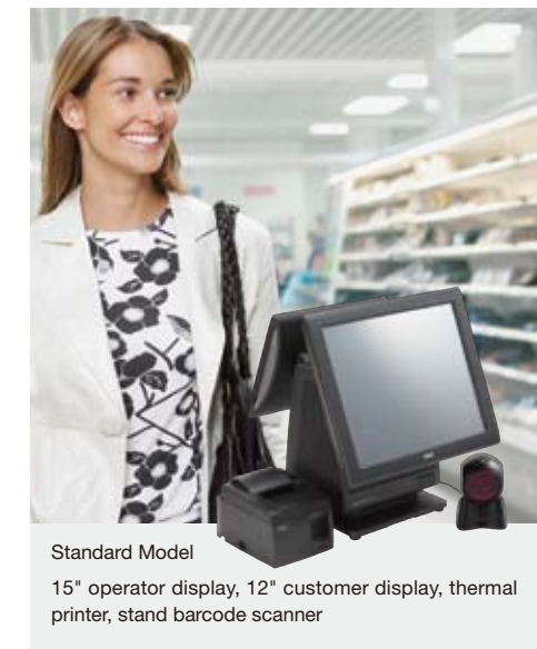
Standard Model 15" operator display, 12" customer display, thermal printer, stand barcode scanner