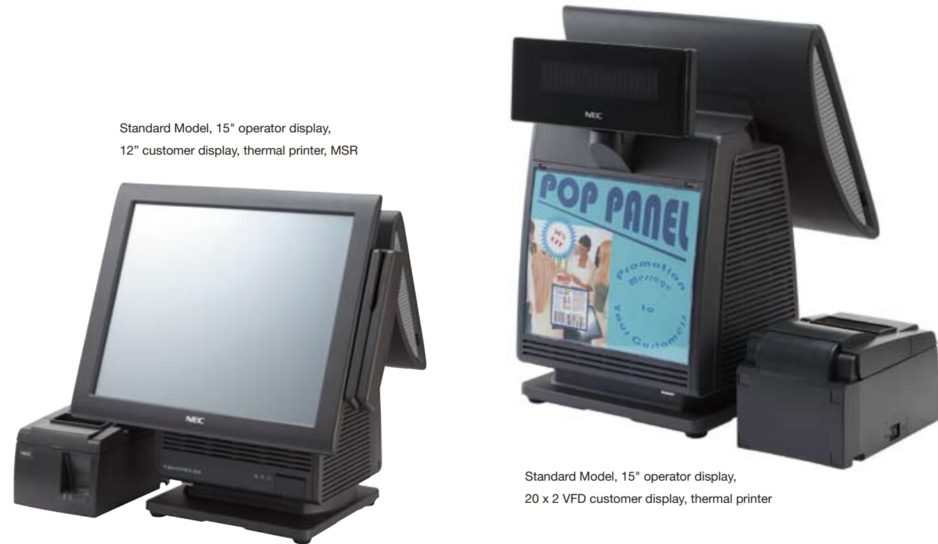
Standard Model, 15" operator display, 12" customer display, thermal printer, MSR